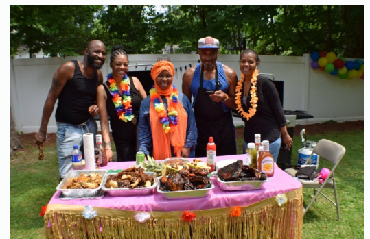
The Lawnridge Team